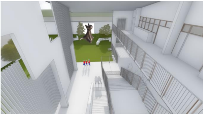
Looking north from inside new Library