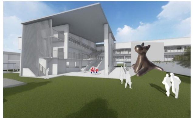
This is the north west corner