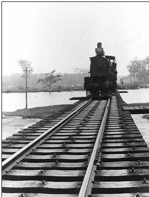
Currumbin Railway Bridge, circa 1931