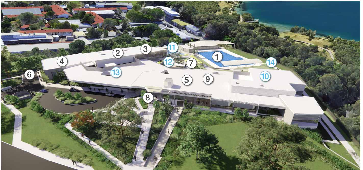
Palm Beach Aquatic and Community Centre concept design.