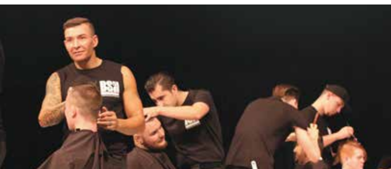
Brisbane Hair and Beauty Expo (Be-YOU-tiful Bar)

At AAHB our goal is to assist your progression at every stage of your chosen field. Our delivery is the ideal blend of theory, workshops, demonstrations and extensive practical experience in the student salons and clinic. Additionally we incorporate many other opportunities for our students that increase industry exposure, help build your portfolio and develop your industry network.