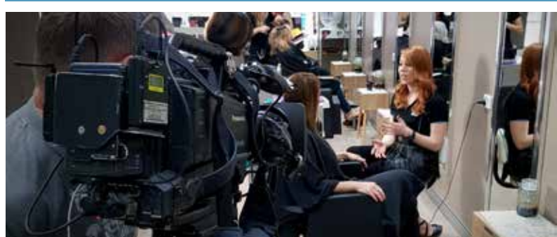
Movie shoots and organised events