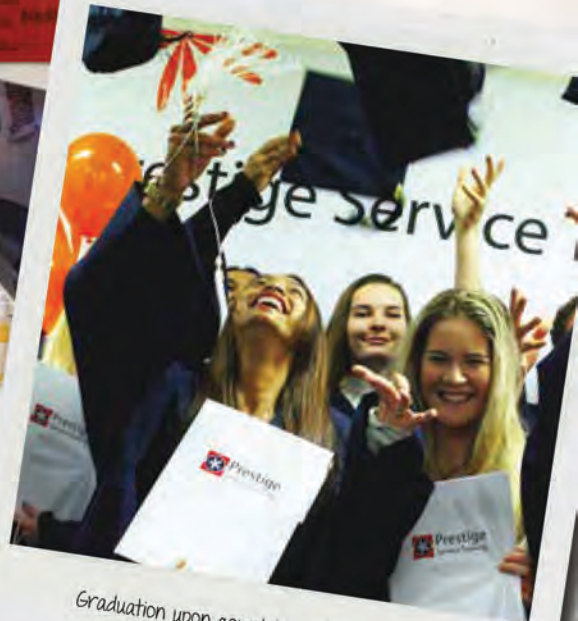
Graduation upon completion of your Diploma