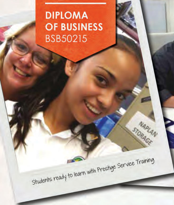
Students ready to learn with Prestige Service Training