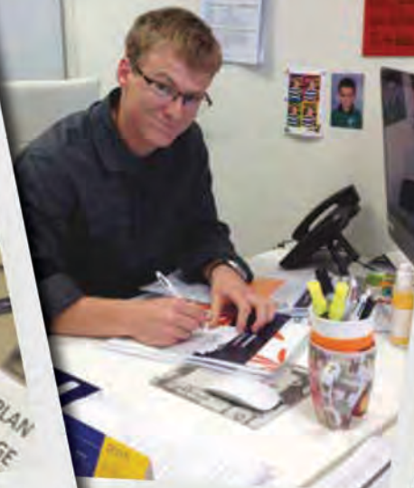
Train and learn with friends at school